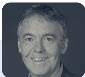
Sir Jeremy Darroch

Sir Jeremy is a Senior Independent Non-Executive Director, and Chair Elect, of Reckitt Benckiser Group plc, an Independent Director of Walt Disney Co, Chair of the National Oceanography Centre, an Independent Director at Ahren Acquisition Corp., an ambassador for the World Wide Fund for Nature (WWF) and a Senior Adviser of Bain Capital and the Multichoice Group. Sir Jeremy served as Adviser to Sky following 14 years of leading the company as CEO then Chair.