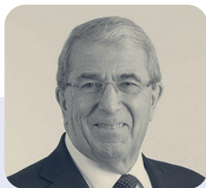
Sir Roger Carr

The Advisory Board are all very experienced CMi Mentors. The Board meet regularly to review progress and guide management on strategic issues such as appointments of partners and Mentors, best-practice improvements, investments and expansion plans.