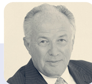
Dr Franz Humer