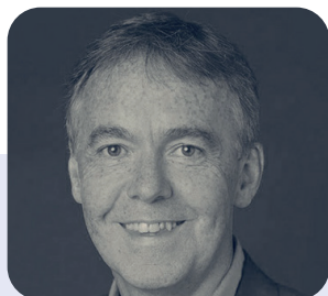
Sir Jeremy Darroch

Sir Jeremy is a Senior Independent Non-Executive Director, and Chair Elect, of Reckitt Benckiser Group plc, an Independent Director of Walt Disney Co, Chair of the National Oceanography Centre, an Independent Director at Ahren Acquisition Corp., an ambassador for the World Wide Fund for Nature (WWF) and a Senior Adviser of Bain Capital and the Multichoice Group. Sir Jeremy served as Adviser to Sky following 14 years of leading the company as CEO then Chair.