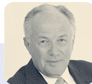
Dr Franz Humer

Ilham is CEO of Solvay; and a Board member at L'Oréal and A.O. Smith Corp. She is also the Chair of the World Business Council for Sustainable Development (WBCSD) since 2022, and Vice President of the European Chemical Industry Council (CEFIC). Under Ilham's leadership, Solvay launched its new purpose, its G.R.O.W. strategy, Solvay One Planet committing to carbon neutrality, and Solvay One Dignity targeting an inclusive and equitable culture to promote diversity.